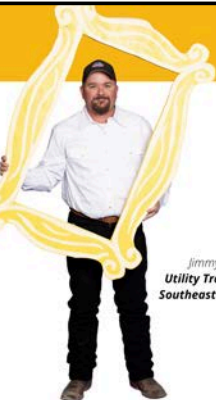
Jimmy Hays Utility Trailer Sales Southeast Texas, Inc.