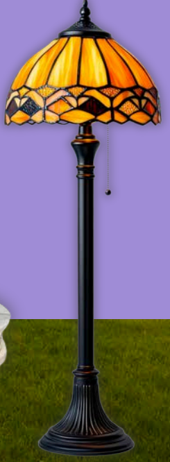
Gold Sponsor

THURSDAY MAY 15 2025 AMARILLO CIVIC CENTER