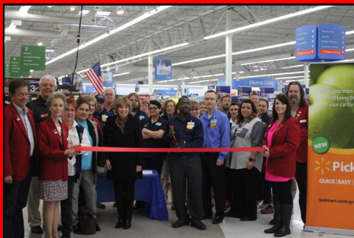
Walmart 4610 S Coulter

Be sure to look for our AMARILLO GLOBE-NEWS Ribbon Cutting photos in: amarillo.com