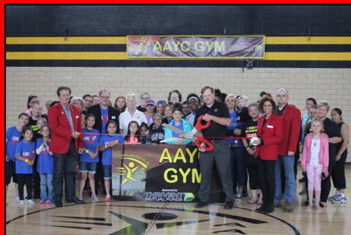
Amarillo Activity Youth Center 816 S Van Buren