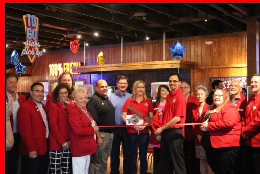
Fuddruckers 8518 I-40 West