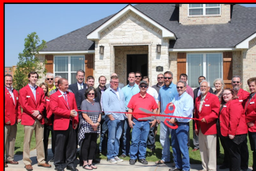
Texas Panhandle Builders Association 5805 Nancy Ellen