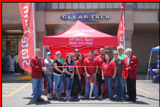
State Farm / Jeff Bara 1203 S Grand