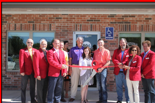
806 Barber & Beauty 3350 Olsen Blvd., Suite 800

Click on http://bit.ly/RibbonCuttingsMay2016 to download these pictures.