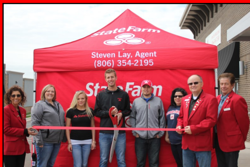
State Farm / Steven Lay 6014 S Western, #300