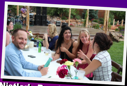
Nistler's Resplendent Garden