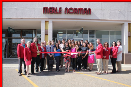
Merle Norman Cosmetic Studio 3440 Bell, Suite 106