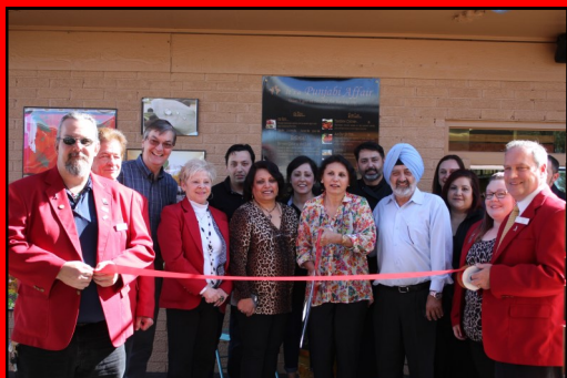
It's a Punjabi Affair 4201 Bushland Blvd.