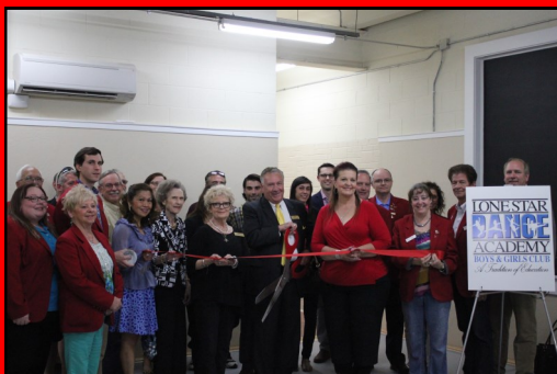
Lone Star Ballet at the Boys & Girls Club 1923 S Lincoln