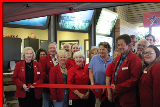
Texas Panhandle Travel Rally Day 9700 I-40 East