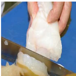
Prepare and serve food safely including special events.

The preparation of potentially hazardous food requiring limited preparation, such as hamburgers and frankfurters, and whole meat BBQ that would require only seasoning and cooking may be prepared in the booth/cook off area. Caution must be taken to protect the food, the table the food is prepared on and any utensil used in the preparation.. Foods requiring extensive preparation MUST BE prepared in a kitchen, already permitted by the Department, or a church, school, or club kitchen that would have adequate facilities to handle the foods prepared unless the booth can meet all food protection standards mentioned.