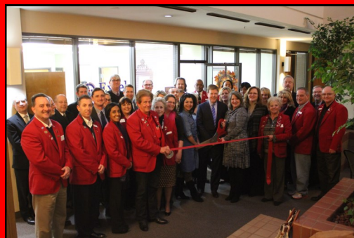
Excel Title Group 6900 I-40 West