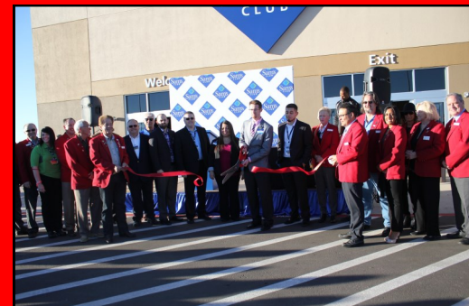
Sam's Club 8962 Westgate