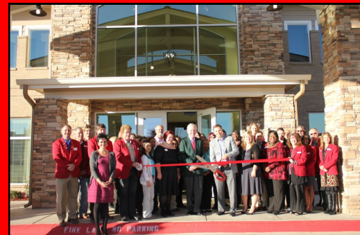
Heartis Amarillo 1610 Research Street