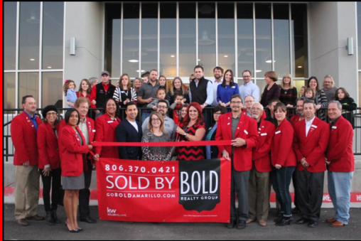
Bold Realty Group 3955 S Soncy

Click on http://bit.ly/RibbonCuttingsNov2015 download these pictures.