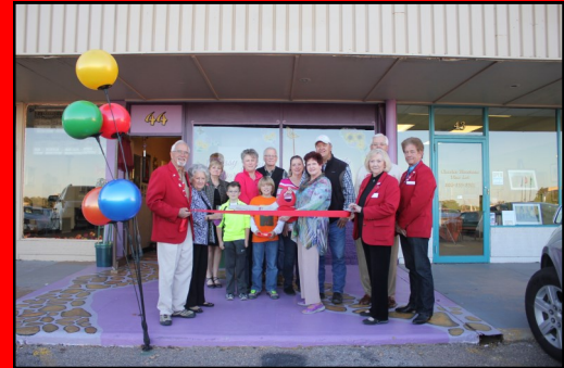
Classy Glass Yard Art 3701 Plains Blvd. #44