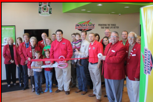
Interstate All Battery Center of the High Plains - 2323 S Georgia