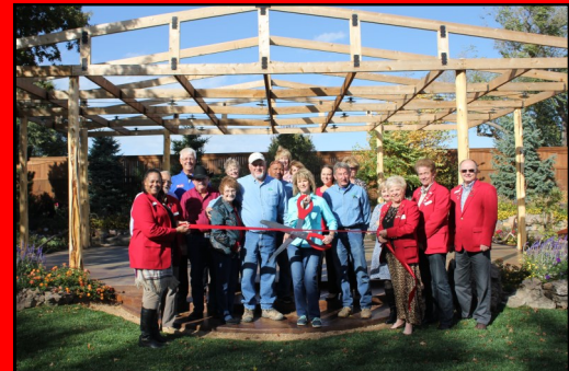
Nitstlers Lawn & The Resplendent Garden 11701 Truman Street