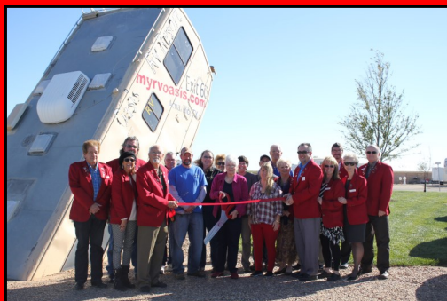
Oasis RV Resort 2715 Arnot Road