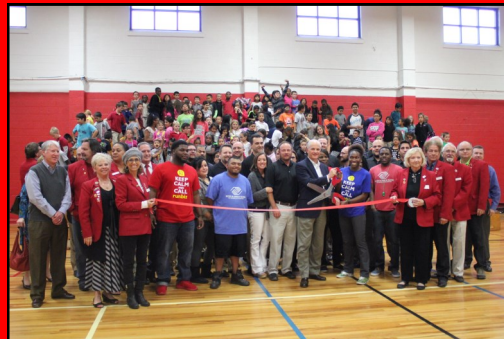
Boys & Girls Club of Amarillo & Canyon 1923 S Lincoln