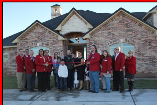
Loma Custom Homes 8721 Lupine