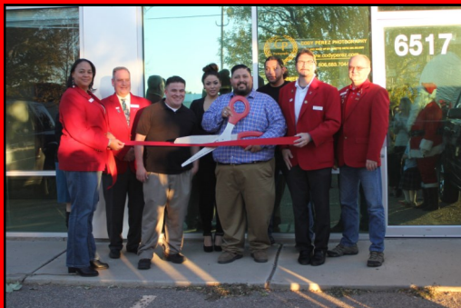
Cody Perez Photography 6517 Storage Drive