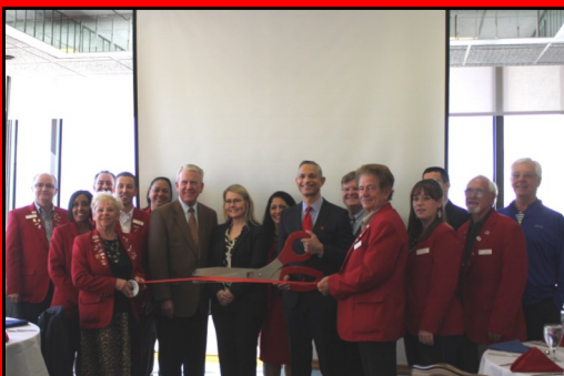
NTS Communications 806.776.4195