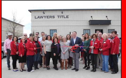
Lawyers Title 4810 Lexington Square