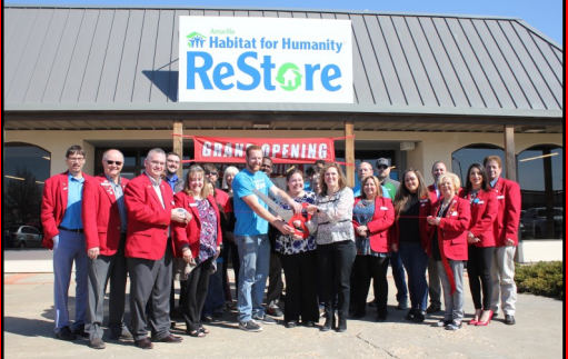
Amarillo Habitat for Humanity ReStore 2626 Paramount