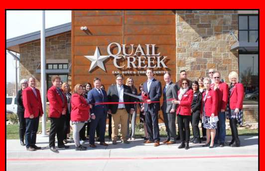
Quail Creek ENT Center 6830 Plum Creek Drive