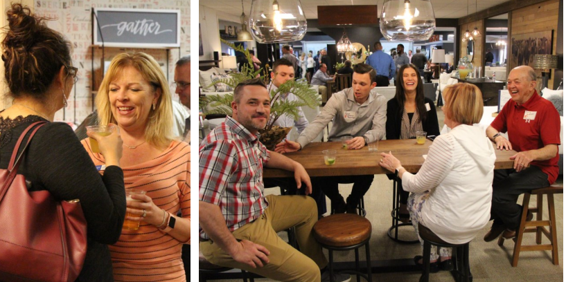
View photos from the After Hours at Rockwood Furniture at <u>http://bit.ly/AfterHoursRockwood2019Pics</u>