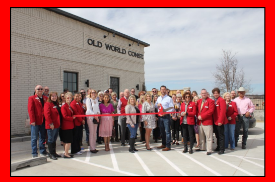
Old World Construction 4804 Lexington Square