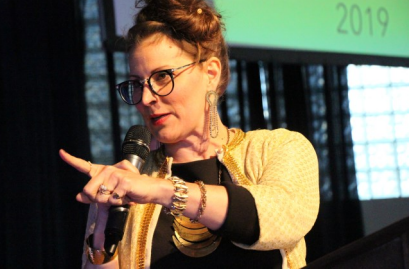
View more photos from the Golden Nail Awards in our Flickr album at: http://bit.ly/GoldenNail2019Pics