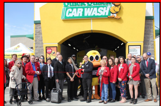
Quick Quack Car Wash 4175 S Georgia