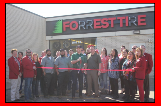
Forrest Tire Company 6605 I-40 West