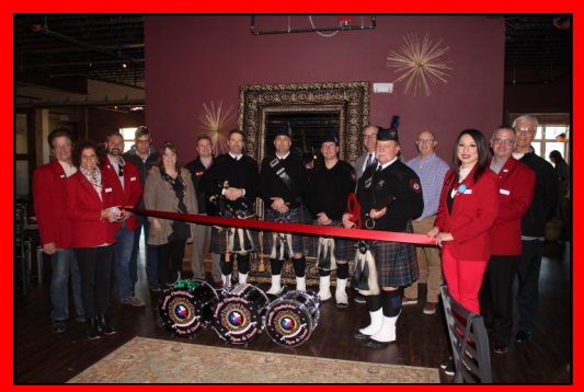
Amarillo Firefighter's Pipes & Drums AFFPD.com

Click on http://bit.ly/RibbonCuttingsMarch2019 or a photo below to view or download these pictures from Flickr.com.