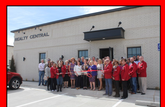
Realty Central 4804 Lexington Square