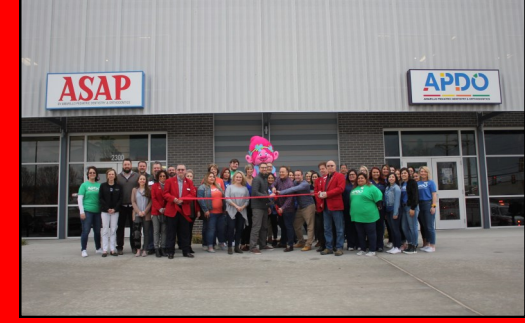
Amarillo Pediatric Dentistry 2300 Wolflin