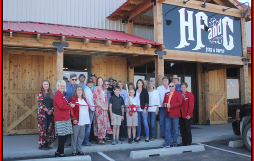
HF&C Feeds Amarillo 10410 I-27